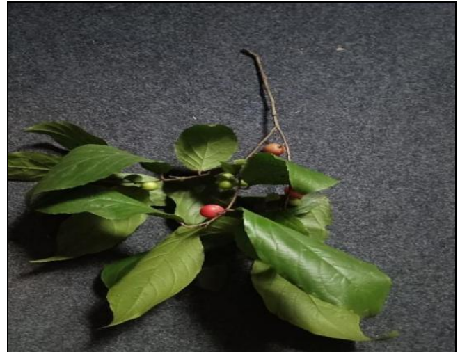
Fig 2: Leaves of Flacourtia jangoma

The tropical fruit-bearing plant F. jangomas is a member of the Salicaceae family [2] . F. jangomas possess fungicidal, bactericidal, antihyperglycemic, antidiarrheal, analgesic, antioxidant, cytotoxic activity [3] and hepatoprotective activity [4] . Leaves and bark are slightly acidic and acrid and reported to be useful in diarrhea, piles, weakness of limbs, bleeding gums, toothache, and stomatitis [5] . The plant is astringent, acrid, sour, refrigerant, and stomachic and used for a variety of ailments like diarrhoea, inflammation, skin disease, jaundice, tumors, nausea, dyspepsia and diabetes in South Indian traditional medicine [6] . The important compounds reported in Flacourtia jangomas was Limonoids (limonin and jangomolide) [7] . The fruit extracts, the plant leaves and roots have medicinal characteristics. It can be used as antibiotic, antioxidant, analgesic and antidiarrheal medicine [8] .