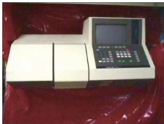
Fig 1: FTIR spectrophotometer Perkin-Elmer1600

Functional bonds present in methylene blue were studied using an FTIR spectrophotometer (Perkin-Elmer1600). The absorbance of the dry sample was measured in the spectral range of 4000–500 \text{cm}^{-1} for 128 scans at a speed of 16 \text{cm}^{-1} .