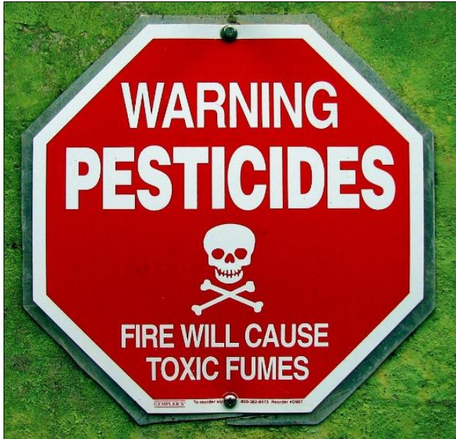
Fig 3: Warning [9]