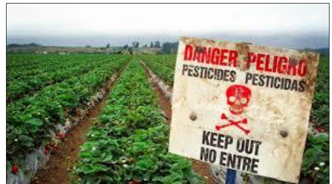
Fig 4: Pesticide poisoning [17]

Pesticides can be hazardous to humans and other non-target species, with the severity depending on the frequency and quantity of exposure. Toxicity is also affected by the rate of substance absorption, distribution within the body, metabolism, and elimination. Pesticides such as organophosphates and carbamates work by decreasing acetyl cholinesterase activity, preventing acetylcholine breakdown at the brain synapse. Excess acetylcholine can cause muscle cramps or tremors, as well as confusion, dizziness, and nausea. According to research, farm workers in Ethiopia, Kenya, and Zimbabwe have lower plasma acetyl cholinesterase concentrations, the enzyme responsible for breaking down acetylcholine acting on synapses throughout the nervous system. (Fig. 4) [17]