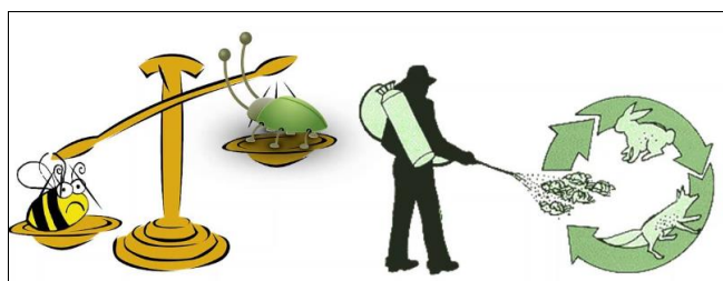
Fig 4: Environmental effects [21]

Pesticide use causes a slew of environmental issues. Over 98% of sprayed insecticides and 95% of sprayed herbicides end up somewhere other than their intended target, including non-target species, air, water, and soil. Pesticide drift occurs when pesticides are suspended in the air as particles are moved by wind to contaminate locations. Pesticides are one of the leading sources of water pollution, and certain pesticides are persistent organic pollutants that pollute soil and flowers (pollen and nectar). Furthermore, pesticide use can have a negative impact on adjoining agricultural activity because pests will drift to and injure crops that have not been treated with pesticides. [21]