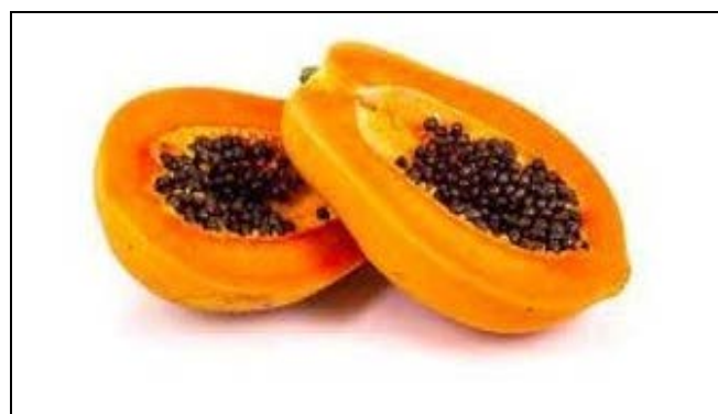
Fig 1: Papaya fruit

Biological source: This is the ripe fruits obtained from plants of species Carica papaya . Belonging to family Caricaceae.