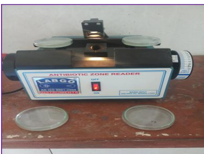
Fig 3: Antibiotic Zone Reader