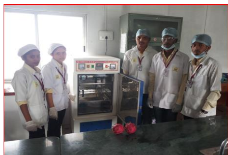
Fig 2: Antibacterial Study ( In vitro ) in Lab